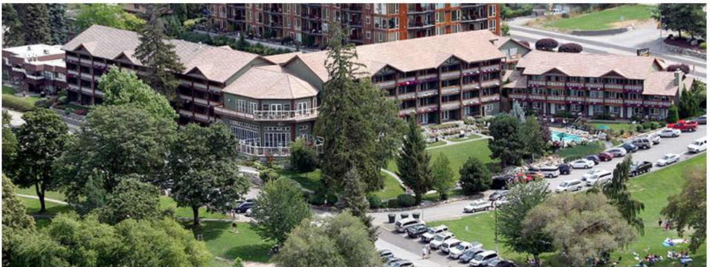
Lakeside Lodge & Suites has many family-friendly amenities.

Take a drive around the lake to this pretty site with a huge outdoor play space complete with a slide and merry-go-round. Tastings are free, though you might want to pay for a glass of one of their reserves. The restaurant is a little high-end for kids, but you can sit outside with some snacks before heading back into town for dinner.