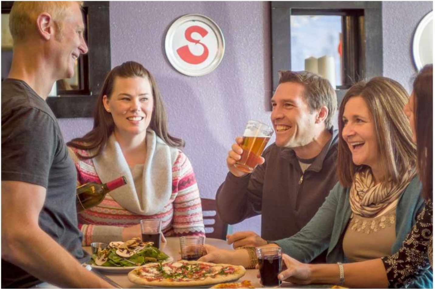
Local Myth Pizza is a must-stop if you travel to Chelan with kids.